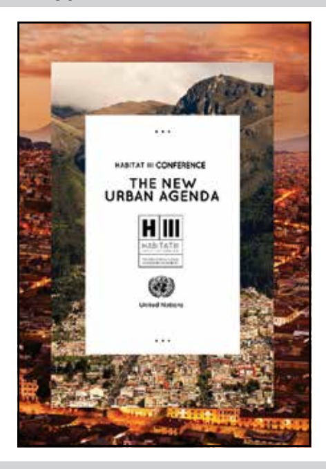
Habitat III conference Brochure available on https://habitat3.org

Habitat III is the United Nations Conference on Housing and Sustainable Urban Development, and is taking place in Quito, Ecuador, from 17 – 20 October 2016.