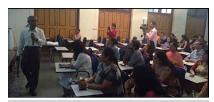
Lecture Session & live demonstration and practical implementation to protect yourself and safe evacuation during earthquakes & terrorist attacks